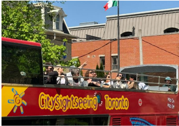
Hop on Hop off Double Decker Tours