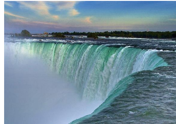
Niagara Falls Day Tours